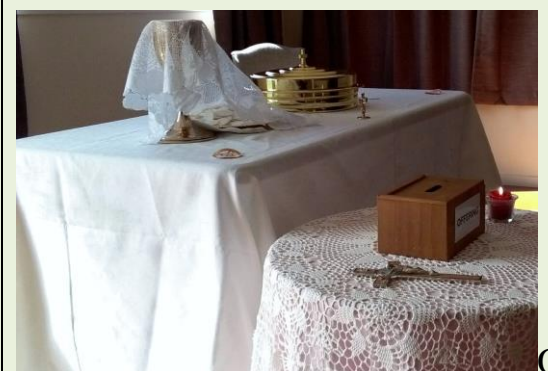
Our first Sunday at St Barnabas

As we are getting ready for celebrating our Lord's birth, let us remember that Christmas is not only a time for Father Christmas. Remember, our Lord is the reason for the season.